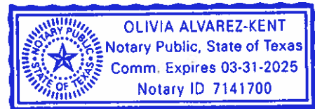
Notary Public in and for the State of Texas My Commission expires: 03-31-2025